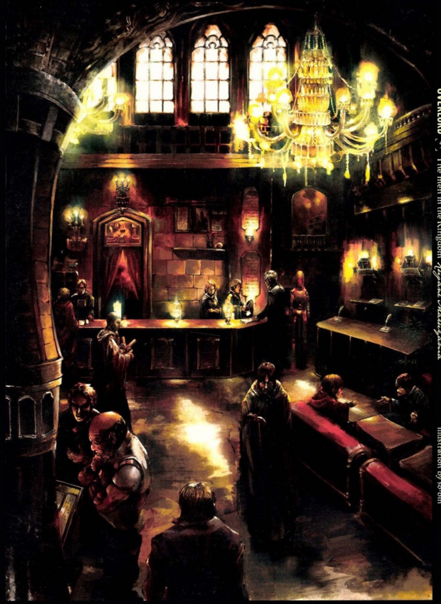
illustration by so-bin

OVERLORD 5 The men in the Kingdom Keigame Maruyama