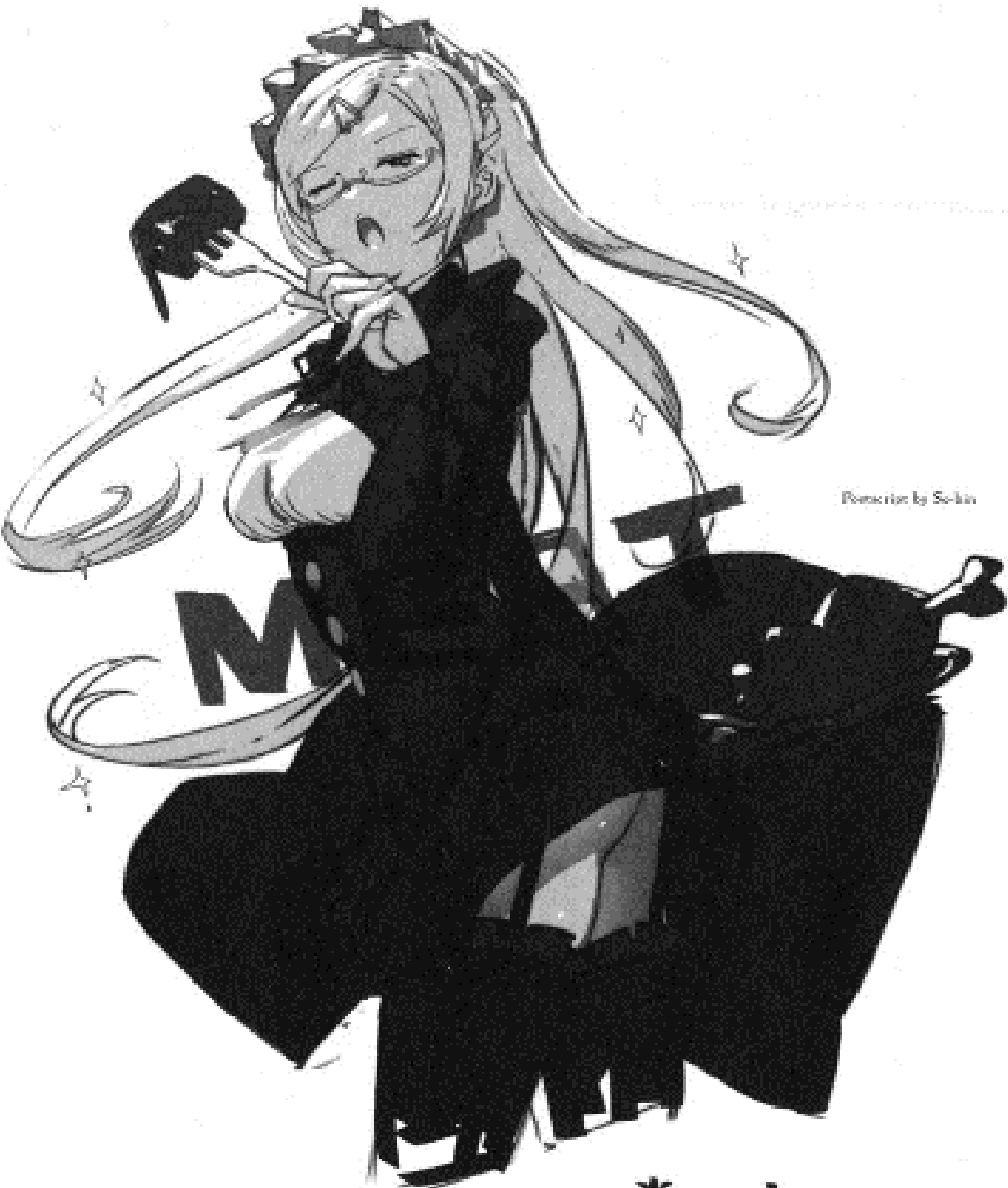
Illustration by So-bin

おかげさまで10巻です。 アニメのサウンドトラックを聞きながら読んで すげー良かったです。so-bin