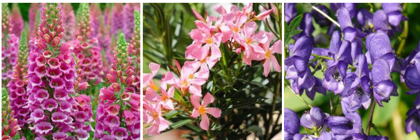
TN: From left to right is foxglove, oleander and aconite.

Beside those, there were daffodils, lily of the valley and rhododendrons.