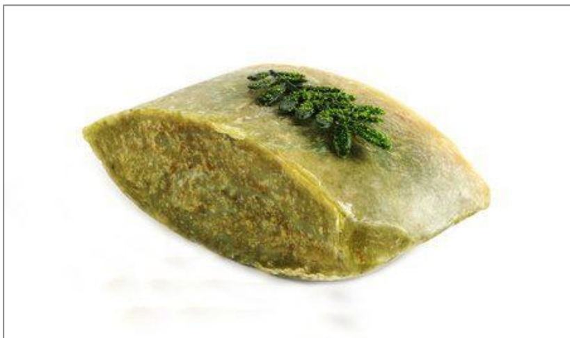
TN: Seaweed Soap

In addition, this area also produced seaweed, which was a material to make soap, so my cousin established a soap manufacturing facility in this area.