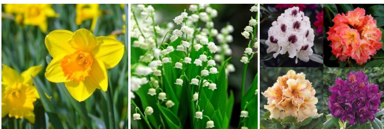
TN: Left to right is daffodil, lily of the valley and rhododendrons.

Beside those, there were daffodils, lily of the valley and rhododendrons.