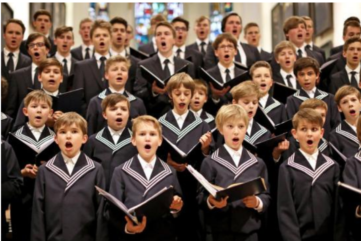
TN: Vienna's Boys Choir

The beautiful voices that were spun as the song began were clear like a famous foreign boy choir.