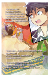
Aladdin's Palace Right