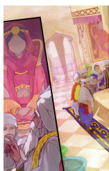
Aladdin's Palace Left